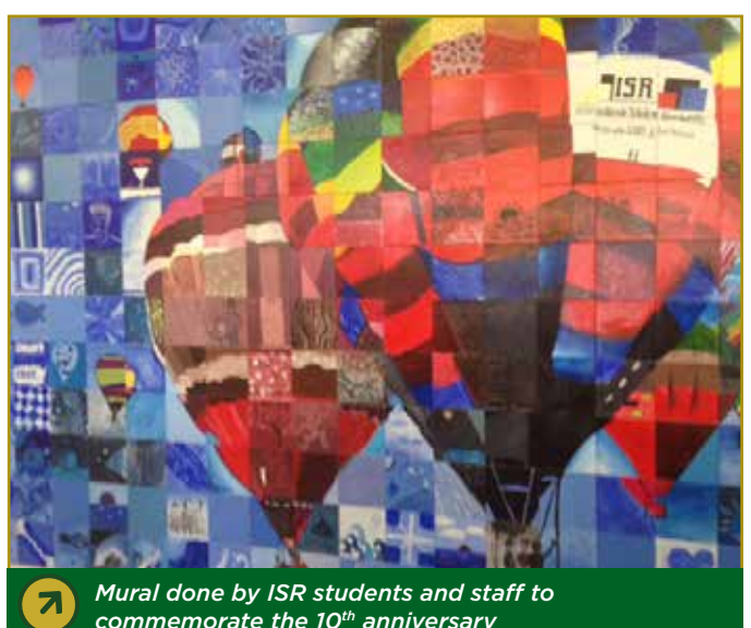
commemorate the 10th anniversary

Brilliant sunshine greeted a crowd of approximately 500 guests who attended the 10<sup>th</sup> anniversary celebration at ISR Internationale Schule am Rhein in Neuss in Germany on Sunday, September 15, 2013. Students, current and former, parents, teachers, staff, board members, stakeholders, and the press were among those in attendance for the event to mark the school's 10 successful years in operation.