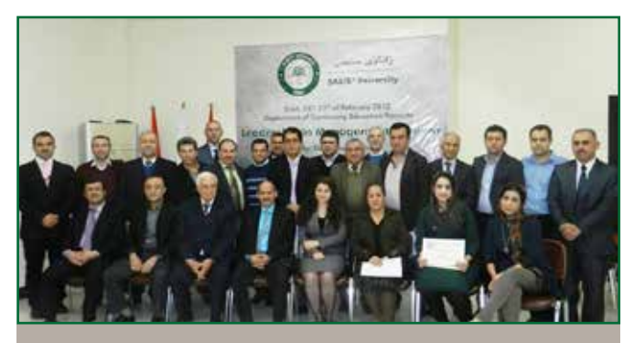
Leadership in Management seminar at SABIS® University

In addition to three colleges, the university also includes a comprehensive Continuing Education Department (CED), which seeks to serve the needs of professionals in Kurdistan. Through a wide range of professional seminars on offer, the CED offers local professionals the opportunity to update and develop their knowledge and skills and remain competitive in today's ever-changing and challenging employment market.