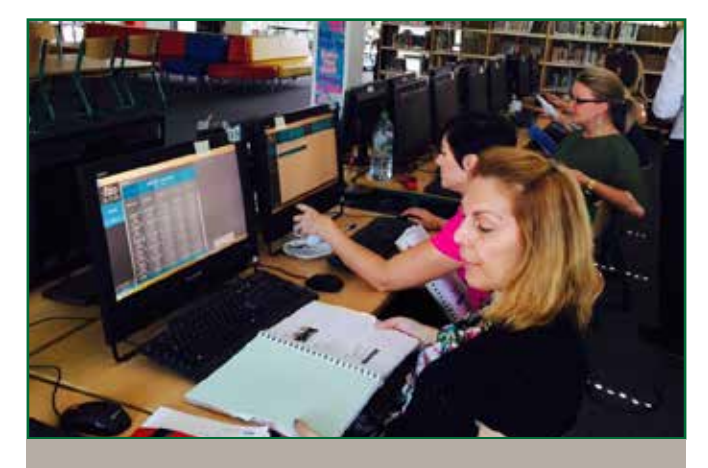
SPDI and ISR teams hard at work

As a global network that operates in 16 countries on four continents, SABIS® is committed to ensuring that all schools within the network deliver consistent results. This consistency is achieved through network schools' accurate implementation of the proven SABIS® Educational System, an effort supported by the SABIS® Professional Development Institute.