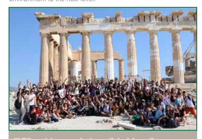
SLTC participants at the Acropolis in Athens, Greece

Every year, the SABIS® Student Life Organization® (SLO®) holds a training camp that brings together selected SLO® prefects from SABIS® Network schools around the world. As part of the camp, which is held in a different location each year, students have the chance to develop skills they can use to impact others and learn new skills that will help them take their SLO® and school environment to the next level.