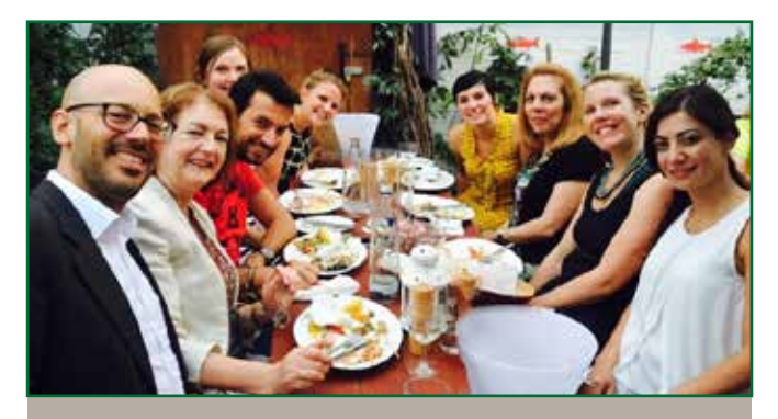
RS and SPDI teams enjoy a group lunch during training

In Neuss, Germany, at the International School on the Rhine (ISR), a SABIS® licensee, SPDI held an across-the-board orientation for administrators, AQCs, and SABIS® Student Life Coordinator (SLC). The training took place over two days and covered a wide range of topics. SPDI explained the SABIS® philosophy and emphasized the various roles and responsibilities found in the SABIS® Network. SPDI also organized workshops that focused on themes like developing others, communicating for leadership success, and coaching for peak performance.