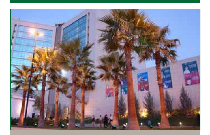
SABIS® University in Erbil, Kurdistan, Iraq

SABIS® University, located in Erbil, Kurdistan, first opened its doors in September 2009 and set out on a mission to provide high-quality education to a new generation of young men and women who could contribute to building Kurdistan. Today, starting its sixth year in operation, the university has built a strong reputation as a provider of top-quality tertiary education in the region.