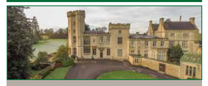
SABIS International School UK in Bath, England

In July and August 2015, the SABIS International School UK (SIS-UK), a member of the global SABIS® Network located in Bath, England, hosted the 9th SABIS® Educational Summer Camp. The SABIS® Educational Summer Camp offers a program that blends academic learning with a wide array of activities and adventures and does so on a stunning campus nestled in the heart of the British countryside.