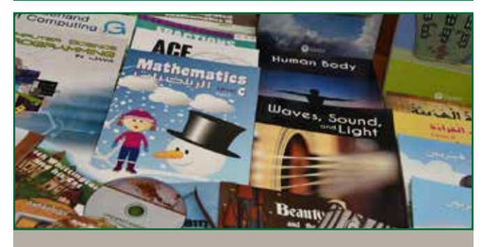
New titles in the SABIS® Book Series

The SABIS® Educational System is a comprehensive educational program that consists of a wide variety of tools to ensure that students are equipped for success. Among these tools is the SABIS® Book Series. The proprietary series, which is comprised of over 1,800 titles across all grade levels (preschool through Grade 13) and all subjects, ensures that the learning process is targeted, efficient, and effective. Designed to dovetail with the dynamic SABIS® curriculum, the series is updated and expanded annually by the SABIS® Academic Development Division based on changes in external exam requirements, feedback from teachers and stakeholders, and an internal review of materials.