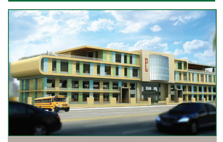
Rivadh Private International School-Al Wadi campus

Located in Riyadh, Saudi Arabia, the Riyadh Private International School-Al Wadi (RPIS-Al Wadi) opened its doors in September 2013 to 300+ students in Kindergarten through Grade 3. The school, which is located on a new, purposebuilt campus, boasts modern sports facilities, an indoor swimming pool, and a tricycle track in addition to several courts equipped with highly-secure play areas for students. The campus also includes state-of-the-art classrooms with interactive whiteboards and science and computer laboratories as well as a cafeteria.