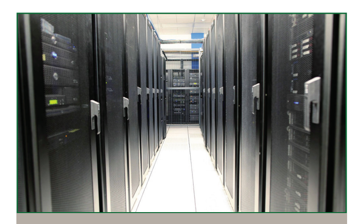
SABIS®'s data center in Minnesota. U.S.