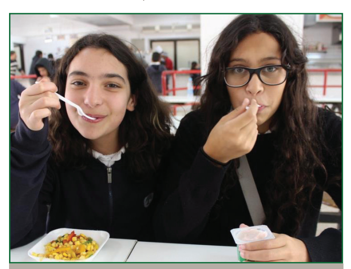
ISC-City of 6 October students eating healthy meals in the school cafeteria

Precipitating the change was the prevalence of studies showing that students today tend to eat less healthy foods, consume more sugar, and engage in less physical activity than students a generation ago. So, in response to these trends, SABIS® felt the need to address the issue with a serious counterplan.