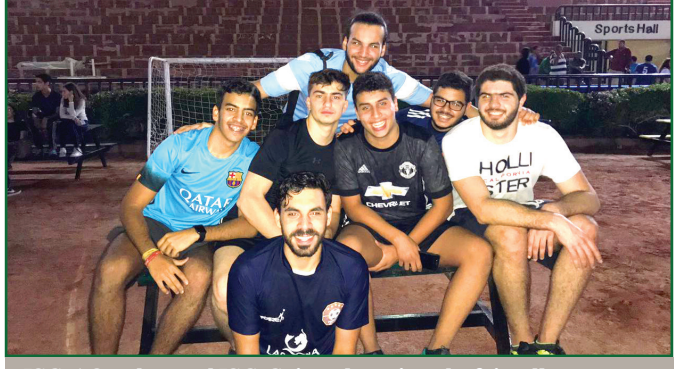
ISC-6 October and ISC-Cairo alumni at the friendly soccer tournament

some fun, just like they did in school. The winners, Team 2014, walked away as champions for the year.