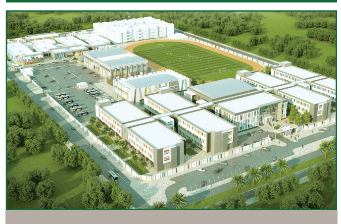
ISC-Ajman school campus

International School of Choueifat – Ajman