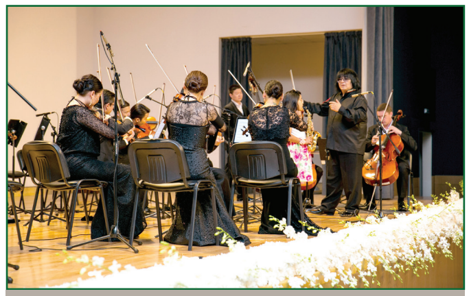
The Almaty Symphony Orchestra during their performance at SABIS<sup>®</sup> Yas Island

The Almaty Symphony Orchestra was created in 2012 by world-famous, virtuoso violinist, Marat Bisengaliev, and general producer, Kairat Kulbayev. The orchestra gathered talented musicians of Kazakhstan, the winners of republican and international contests. The orchestra performed concerts at Carnegie Hall (New York), the Palais des Festivals (Cannes), in the Kremlin (Moscow), and in many other famous halls around the world.