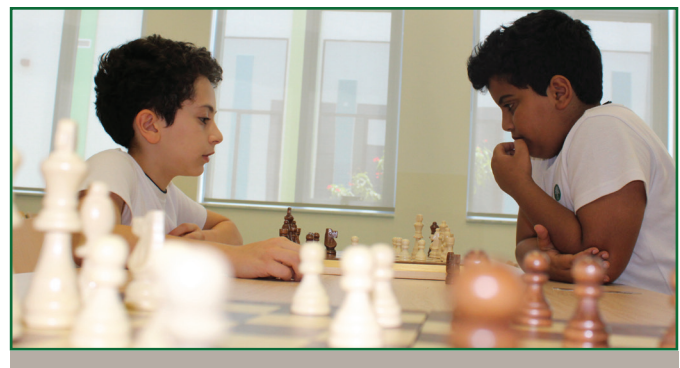
ISC-Ajman students deep in thought

"SLO<sup>®</sup> is all about helping each other. It makes the school a happy and caring place. It teaches us about respect for ourselves, each other, our teachers, and the school. It also keeps us safe and stops bullying."