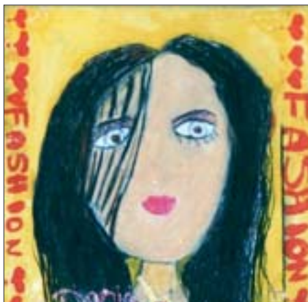
One of the creative drawings

The teams, working in tandem, are re-writing the SABIS® Readers in Spanish. Within the coming academic year, students at SABIS® member schools will be able to read about the adventures of Cabeza de Vaca and other significant historical characters in Spanish.