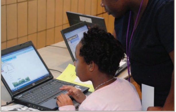
"MATH Family Fun Night" Participants Solve a Math Problem

LPCS's "MATH Family Fun Night" was organized so that families competed to solve math problems which were positioned across the school's gym at 10 different stations. Upon solving the math problem, families received a stamp on individual cards