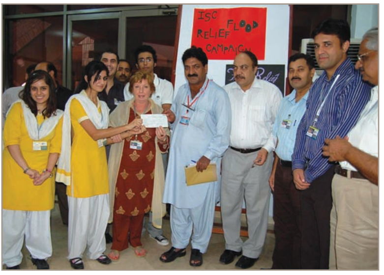
ISC-Lahore Director, Students, and Staff Presenting Flood Relief Campaign Funds to Pakistani Charity, Edhi Foundation

From the onset of the floods, the International School of Choueifat-Lahore reacted through a series of outreach measures. Given the school was on summer holiday and not in session, outreach efforts originated with staff members and alumni who immediately teamed up to