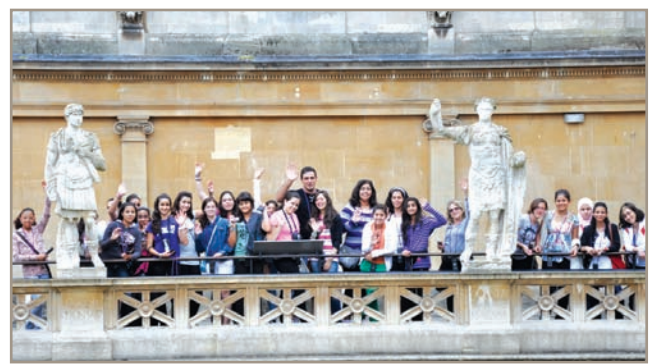
Students Participating in the 2010 SABIS<sup>®</sup> Educational Summer Camp

Like the 2010 camp, students who sign up for the upcoming one will enjoy rich academic programming in the morning, plus engaging weekday activities, such as excursions to historical sites, bowling alleys, ice-skating rinks, and cinemas. During the weekends, students will take part in longer trips and explore some of Britain's most famous cities including Cardiff, Oxford, and London. Talent shows, Friday evening barbeques, and bicycle rides are also on the agenda and have been favorites among past campers.