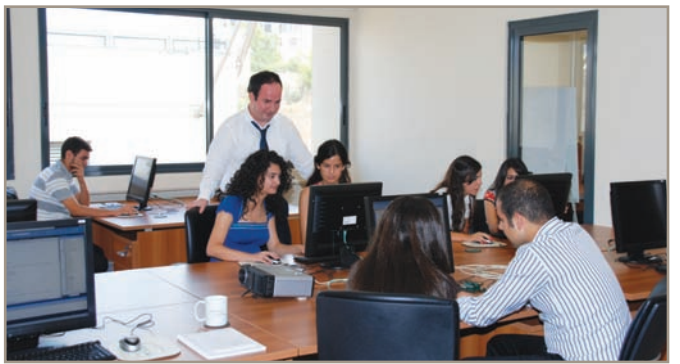
SABIS® Internship Program Participants

Several college students had the unique opportunity to apply their knowledge at the corporate level and gain hands-on experience through an IT internship program held this past summer at SABIS®'s headquarters in Adma, Lebanon. With an aim of locating talented students, the SABIS® HR Department visited Lebanon's most competitive universities and attracted dozens of candidates who were interviewed and assessed.