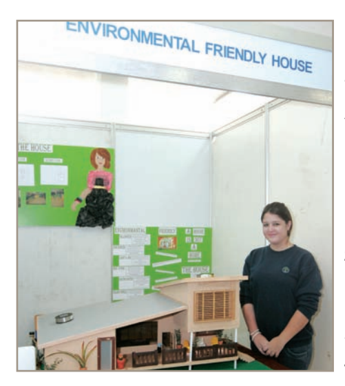
ISC-Al Ain Student with her "Environmental Friendly House" Project

to give it an upthrust. It can be operated by remote control and a wireless camera is installed which can receive sound waves. This hovercraft is built to help fire-fighting and reduce the risk of fire fighters losing their lives," said a student from the team. Three students from ISC-Abu Dhabi were also awarded a Nanju Memorial Jury Award in this category for their "Cubic Forms" project, which involved finding a method that would enable them to identify cube roots of 15-digit numbers.