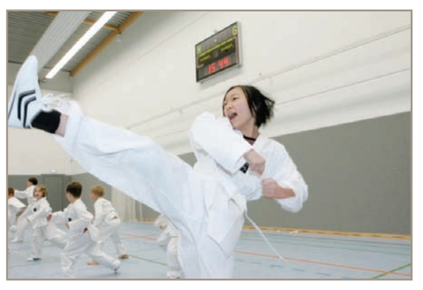
ISR Student Engaged in a SLO<sup>™</sup> Activity

Through ISR's SLO<sup>TM</sup>, students are provided the resources and outlet to take up new interests and develop their individual talents. Moreover, ISR's wide range of SLO<sup>TM</sup> activities—from local sports tournaments and ballet lessons to community service and choir—give ISR students the opportunity to develop life skills that empower them to make a substantial commitment, not only to their own personal development, but also their community. "Students at ISR are showing more and more interest in becoming prefects and making a difference in their school community," said ISR Student Life Coordinator, Mr. Stéphan Michaud.