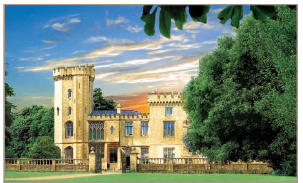
Ashwicke Hall, Site of the SABIS<sup>®</sup> Educational Summer Camp

Following on the heels of the success of the 2010 SABIS<sup>®</sup> Educational Summer Camp, plans are currently underway for a repeat performance in the summer of 2011. Located on SABIS<sup>®</sup> International School U.K.'s 147 acres of sprawling grounds in Bath, England, the camp is accommodating of students' busy summer schedules and offers two sessions. Students who choose to participate in the full session will be enrolled in the camp for five weeks, from July 11<sup>th</sup> to August 12<sup>th</sup>, while students in the shorter session will be enrolled for three weeks, from July 11<sup>th</sup> to July 29<sup>th</sup>.