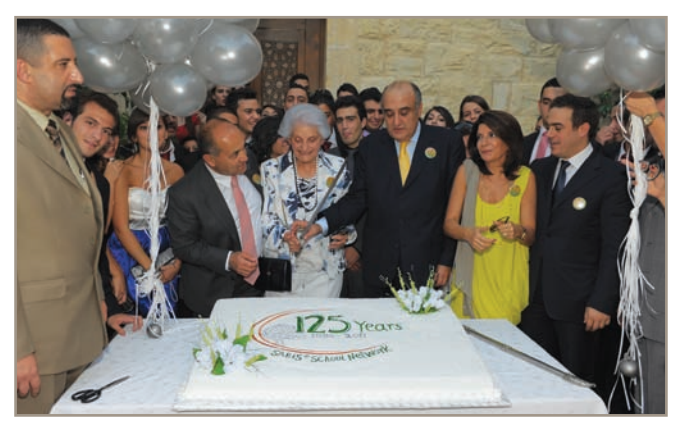
ISC-Choueifat Celebrates 125th Anniversary

Around the world, SABIS<sup>®</sup> students, staff, and community members came together throughout the month of October 2010 to mark the start of the organization's 125<sup>th</sup> year of providing quality education. Currently operating 79 schools and one university that educate more than 60,000 students in 15 countries, SABIS<sup>®</sup> has come a long way since its establishment on October 15, 1886, in Choueifat, Lebanon.