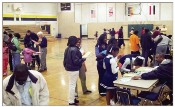
LPCS's "MATH Family Fun Night"

Unique academic awareness events like "MATH Family Fun Night" are in line with LPCS's mission of providing a first-rate education to its students which prepares them to both excel in school and on state exams. Like all schools in the SABIS® School Network, LPCS is ensuring its students benefit from a solid foundation in math and other core subjects through classroom and extracurricular activities.