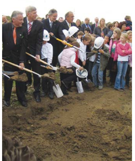
SABIS® President and ISR officials take part in the ceremony

The modern and purposely-designed building is scheduled to be completed by September 2007, in time for the 2007-08 academic year. The new school will include academic, music, and art facilities. In addition, the school, which will be constructed in three phases, will eventually include a theatre and complete indoor and outdoor sports facilities consisting of sport fields, tennis courts, and a semi-Olympic-sized indoor swimming pool. When completed, the