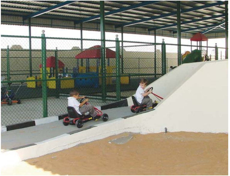
KG Car Track

The International School of Choueifat, Khalifa City 'A' is situated in Khalifa City, a mere twenty-minutes outside of Abu Dhabi, UAE. The new SABIS® member school officially opened its doors on September 3, 2006 and within the first two weeks, the student population increased to over 100 students. Current enrollment at the International School of Choueifat, Khalifa City 'A' totals 170 students of several different nationalities.