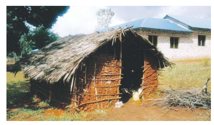
Chitsanze Primary School -Original huts used for classrooms

The Chitsanze Primary School is located near Mombasa and caters for 200 students from Kindergarten through the 8^{\text{th}} grade. The students and their families live in small mud huts which are situated around the school building. There is no water supply or electricity, so the families make a ten-kilometer trek to the nearest city to gather food and water.