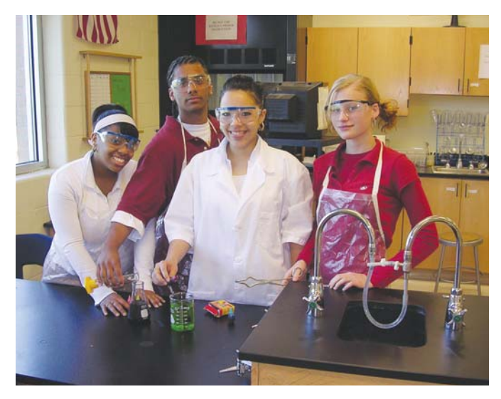
Four SICS students performing a science experiment

SICS students benefit from a rigorous environment based on the SABIS® curriculum, an interactive and dynamic curriculum providing a well-rounded education based on the mastery of English, mathematics, sciences, and world languages.