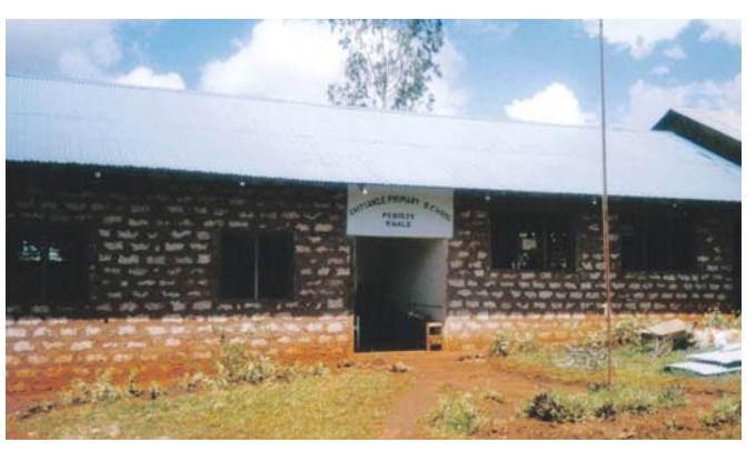
Chitsanze Primary School -Current Classroom