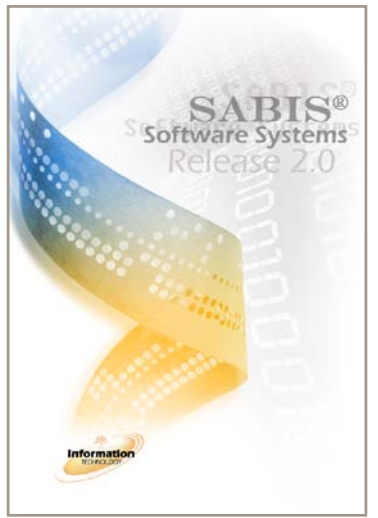
SABIS® Software Systems

Through an innovative approach to Information Technology, SABIS® can ensure that its performance-driven system is best positioned to help all students achieve their full potential.