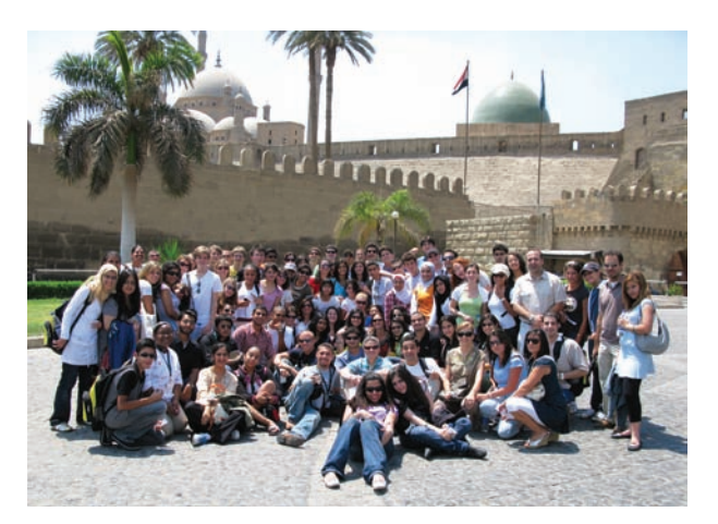
SLO™ Summer Training Camp