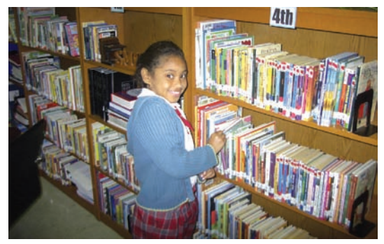
MSANO School Library

In the fall of 2002, Milestone SABIS® Academy of New Orleans opened its doors for students from Kindergarten to Grade 8 in the beautiful Garden District of New Orleans, Louisiana. A member of the worldwide SABIS® School Network, MSANO is a highly academic, non-selective, coeducational public charter school that strives to prepare students for college and a life of continuous learning. MSANO shares its mission with that of all other SABIS® schools in aiming to develop young men and women equipped with the ability and morality to face the challenges of the future and to ensure a better life for themselves, their communities, and the world.