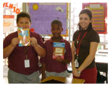
Promoting a Love of Reading

Each year, MSANO students take the Louisiana Educational Assessment Program (LEAP, iLEAP) standardized state exams. The 2007-08 academic year's results showed a surge in students' scores in English and mathematics in comparison to 2006-07. The passing rate of eighth grade students was 64% on English and 67% on mathematics, as opposed to 46% and 36% respectively in the previous year. For fourth grade students, the 2007-08 passing rate was 66% on English and 60% on mathematics, in comparison to 39% on both English and math in 2006-07.