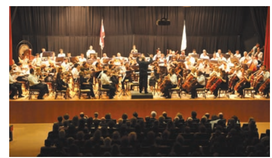
Lebanese National Symphony Orchestra at Charles Saad Performance Hall Inauguration

The Charles Saad Performance Hall will be used to open cultural horizons to the students and community at large. It will unlock the door to hidden artistic and musical talent and will encourage students to pursue these talents at school and beyond.