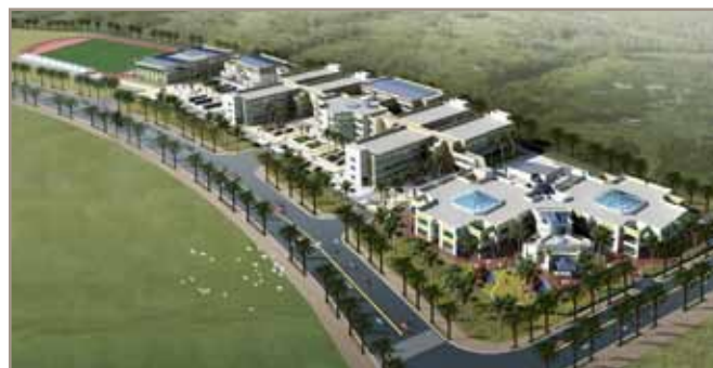
ISC-Dubai Investments Park in Dubai, U.A.E.

Expansion in the number of schools managed by SABIS® in 2012-13 is rounded out by ISC - DIP, the 14 th SABIS® operated school in the Gulf and second school in Dubai. SABIS® has a long history in the region. In fact, back in 1975, ISC-Sharjah was the first SABIS® member school to operate outside of Lebanon.