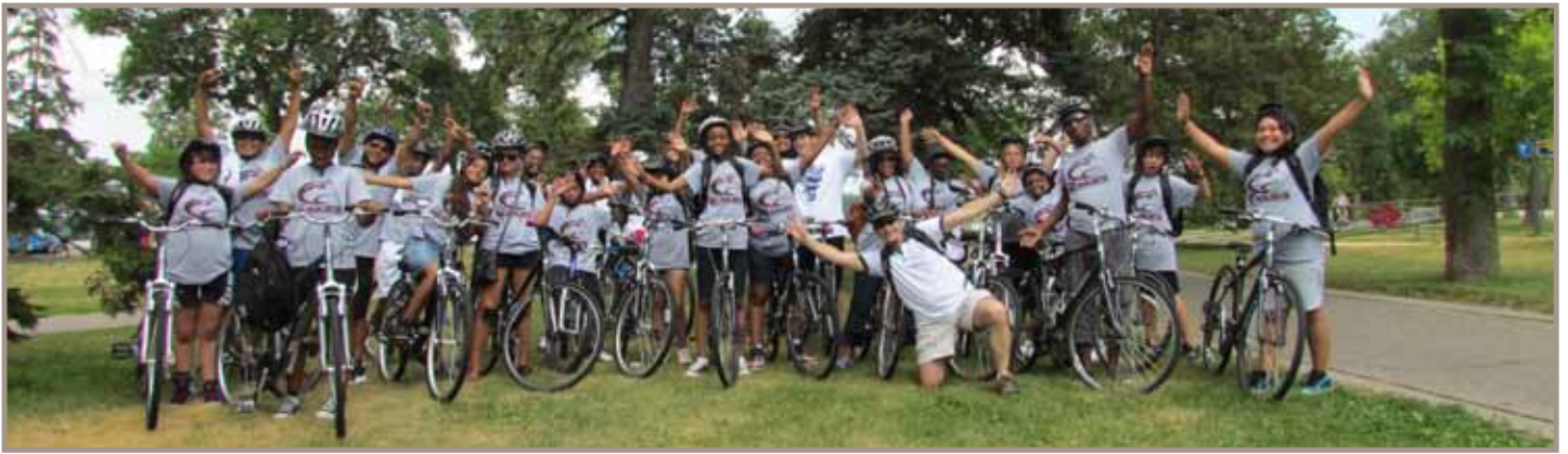
SLO® prefects at the SABIS® Student Life Junior Camp in Minnesota

Like the annual worldwide Student Life Training Camp, the junior camp brought together student leaders and Student Life Coordinators (SLCs) for a unique experience. The camp sought to equip the students in attendance with important life skills and inspire them to share their new skills and knowledge with other students in their schools in order to improve their respective schools.