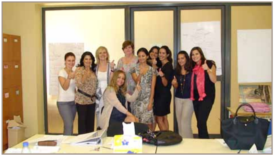
Participants at the Presentation Skills Workshop for AQC's from ISC-Chouifat, SIS-Adma and SIS-Koura held on the SIS-Adma Campus