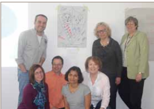
Participants at the Team Building Workshop at ISR in Neuss, Germany

SABIS® is committed to the personal and professional development of its employees. In line with this commitment, the SABIS® Professional Development Institute (SPDI) continuously designs and develops new seminars and training workshops that provide development opportunities for all employees, at all levels and in all fields, to enhance their professional skills and competency level.