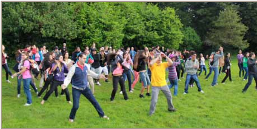
Morning “Dancersize” at the SABIS® Student Life Training Camp in Bath, U.K.

SABIS® firmly believes that education has the power to change the world. The Student Life Organization® (SLO®) is an integral part of all SABIS® schools and gives students the opportunity to develop life skills that empower them to make a difference. Through SLO® activities, students experience real-life responsibilities, develop their leadership and communication skills, gain self-confidence, and learn how to give back to their community. Students are also encouraged to make their school a place for everyone to enjoy.