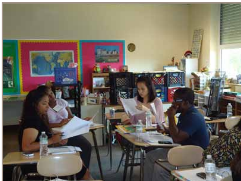
Participants taking part in group work

More specifically, the training included sessions on subject-specific courses, the SABIS Point System®, and IT in SABIS® member schools in addition to sessions on the effective use and management of SABIS Integrated Testing and Learning® (ITL®) and the SABIS Academic Monitoring System® (SABIS® AMS).