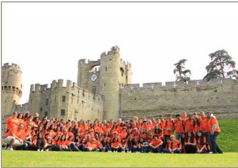
SLO® Camp participants in Bath, England

"The SL training camp has been the most amazing experience I have had so far, and it has really made me believe more in myself and be more confident in what I do. It has also given us all new ideas to implement in our schools." SLTC participant from ISC-Khalifa City, Abu Dhabi, United Arab Emirates