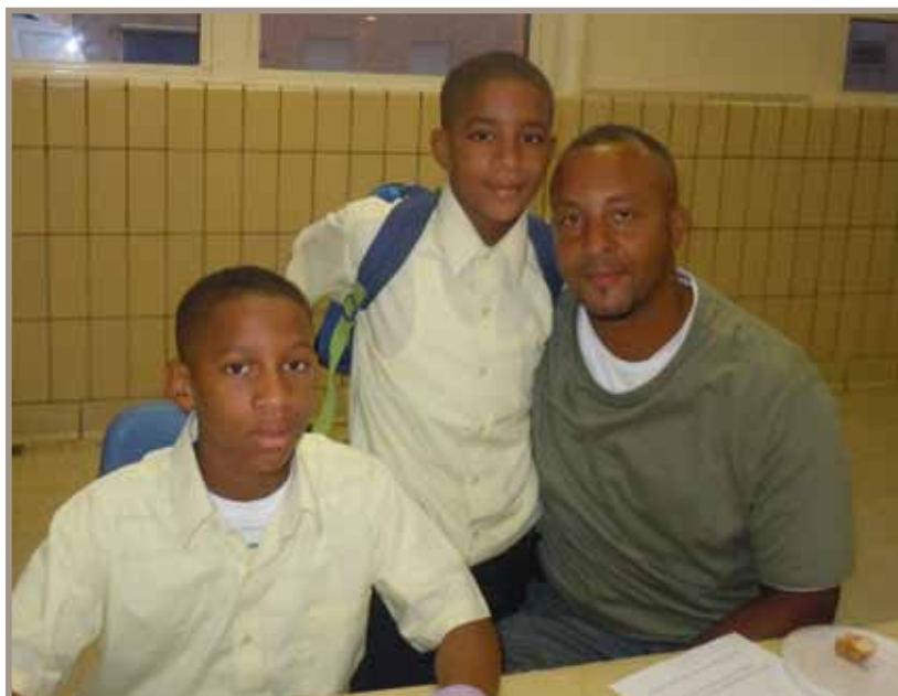
Kids with their father during Donuts with Dad

"The trip to Minnesota was an experience that I will never forget. All the sessions and team building activities were helpful. They made me believe in myself and build character that I will use throughout life. I am thankful for my Student Life Coordinator and Director for choosing me to go and experience this wonderful opportunity." LCPS 8 th grader and participant of the Student Life Junior Camp.