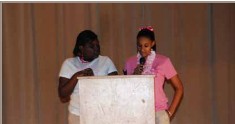
Pink campaign at LPCS

As a member of the SABIS® School Network, LPCS implements the SABIS® Educational System, a comprehensive academic program that has been developed and refined over 126 years. With a balance of academics, self-development, and life preparation, the SABIS® Educational System is based on a challenging curriculum and a disciplined approach to education.