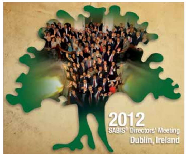
2012 Directors' Meeting attendees at the Royal College of Physicians

Reflecting SABIS®'s ongoing commitment to continual improvement, at the culmination of each academic year, directors from SABIS® member schools around the world are invited to attend the SABIS® Directors' Meeting. Dublin, Ireland played host to the 16 th Annual SABIS® Directors' Meeting from July 4-7, 2012, when over 80 SABIS® school directors, SABIS® Board members, and senior support staff assembled. The meetings provided directors with the