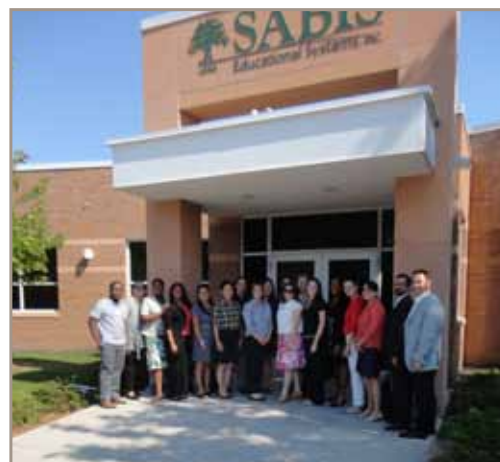
2012 Licensee Leadership Training attendees

Participants included an interesting mix of individuals both new to SABIS® and those already familiar with the comprehensive educational program. Attendees included school directors, deans of instruction, lead teachers, and school leaders, all of whom engaged in the “train the trainer” type of seminar, with participants acquiring the skills and understanding necessary to train the rest of their team upon returning to their school.