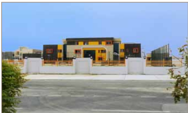
ISC-Dream City in Erbil, Kurdistan

The International School of Choueifat in Dream City, Erbil (ISC-Dream City), in Kurdistan, northern Iraq, four Public-Private Partnerships schools also in Kurdistan, and the International School of Choueifat in Dubai Investments Park, Dubai