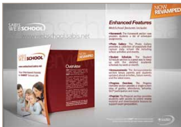
WebSchool brochure to be available in SABIS® member schools

For further information or to provide feedback on WebSchool, please contact your school’s Administration office.