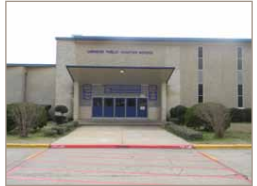
Linwood Public Charter School, Shreveport, Louisiana

Linwood Public Charter School (LPCS) is a public charter school located in Shreveport, Louisiana in the U.S. and is a member of the global SABIS® School Network. The middle school, which was taken over and awarded to SABIS® after recording several years of underperformance, opened its doors in 2009 to students in grades 6 through 8. Today, LPCS provides a quality educational opportunity to the children of Caddo Parish and has a current enrollment of 530 students.