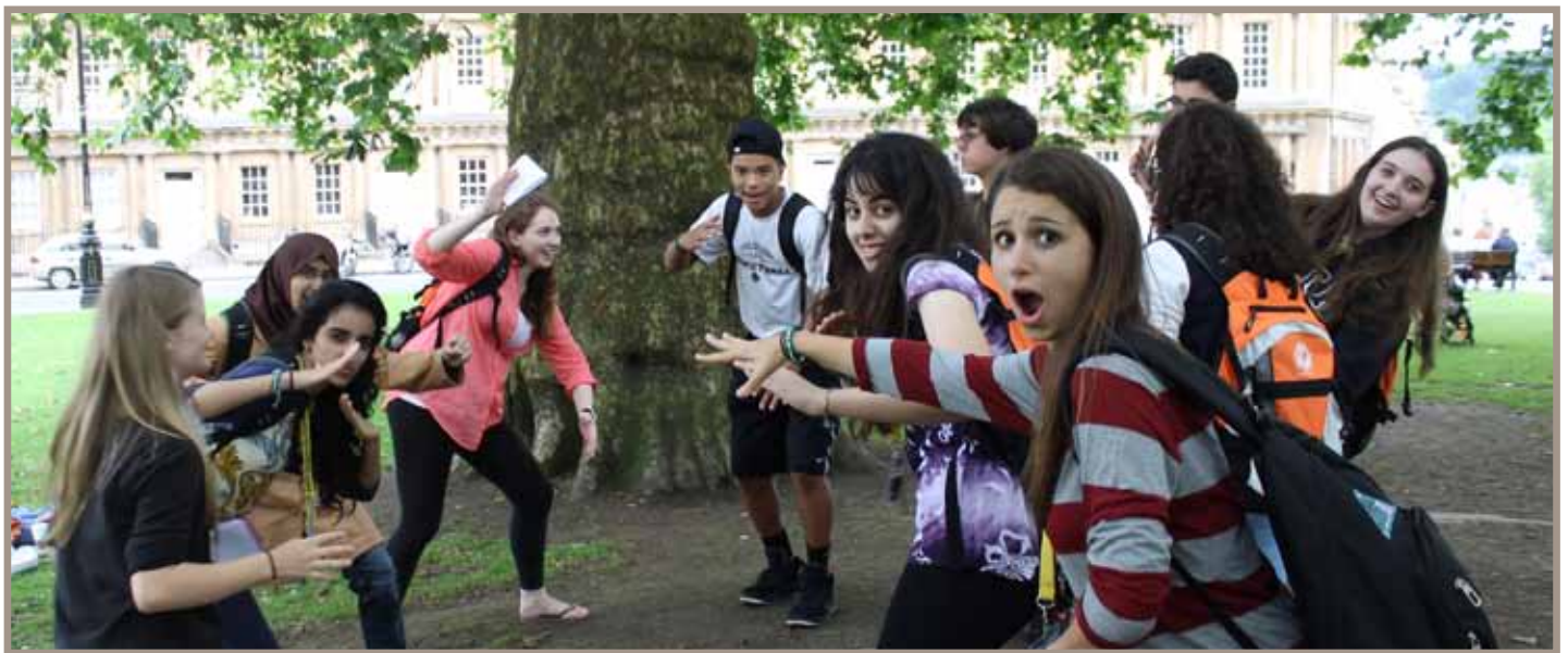
SLO® Prefects surprised by what they find during the Treasure Hunt

"The Student Life Training Camp changed my life. I learned that you can always make a difference if you don't give up, that you should dare to inspire someone. I met the most amazing people, from all over the world that I know I will stay in touch with for a long time. I cherish the memories and what I learned at this camp." SLTC participant from The International School of Minnesota, Eden Prairie, MN, U.S.