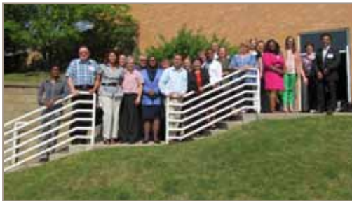
AQC's and the Academic Operations Team at SABIS® USA during the Annual SABIS® Academic Quality Controller Conference

Joining the Licensee Leadership Training for two days of shared workshops were Academic Quality Controllers (AQC's) from SABIS®-managed U.S. schools. Eighteen AQC's from across the U.S. came together to participate in sessions on the new Common Core State Standards (CCSS), the implication of the CCSS on the SABIS® Educational System, and a review of the SABIS® Science Program. The agenda also covered the different tasks pertaining to the AQC's role.