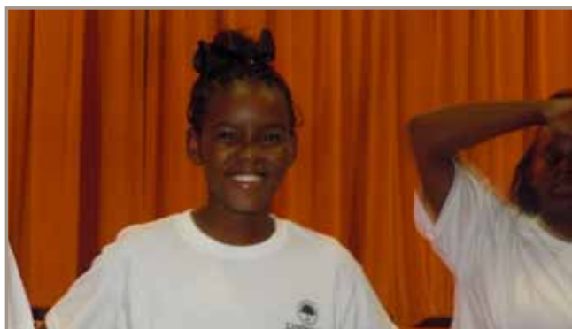
SLO® Prefect at LPCS

LPCS is dedicated to creating a community in which all students can grow, excel, and take pride in their individual and collective accomplishments. To this end, SLO® offers many opportunities designed for students to reach their full potential.