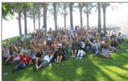
A Break in Al Azhar Gardens

From the minute students landed in Egypt for the 2009 SABIS® Worldwide Student Life Training Camp, they started bonding and anticipating the days ahead. Held from July 25 through August 3, 2009, in Cairo, Egypt, this year's Student Life Training Camp gathered 74 students and 21 Student Life Coordinators hailing from 27 SABIS® member schools around the world.