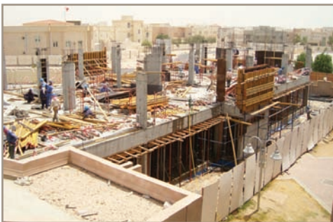
ISC-Doha Construction Site

Expansion of the SABIS® School Network throughout the world is going at full speed as more schools are joining the network and existing schools are adding to their facilities. In fact, many SABIS® schools in the Middle East have witnessed a substantial expansion of their campuses to accommodate the growing number of students, most notably The International School of Choueifat - Doha, Qatar, and SABIS® International School - Adma, Lebanon.