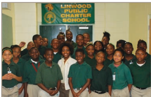
Linwood Public Charter School Campus

Linwood Public Charter School in Shreveport, Louisiana, is the newest school to join the SABIS® School Network in the U.S. in AY09-10. This move came as a result of the decision of the Louisiana State Board of Elementary and Secondary Education (BESE) to award SABIS® Educational Systems, Inc. the operation of the school.