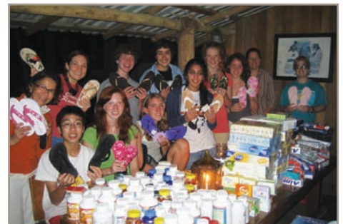
ISM Donation to the Orphanage

The ISM Deputy Head of Outreach summed up the trip by saying, "It was a whirlwind of a trip and I would do it again in a heartbeat. We had an amazing trip; all of us got along great and we all had so much fun!" Indeed, this trip allowed both students and staff to learn about the Honduran culture and bond in their shared experience of service and understanding. But most importantly, the trip came in the framework of the SLO™'s focus on promoting community service projects in order to contribute to the improvement of their own lives and the lives of others.