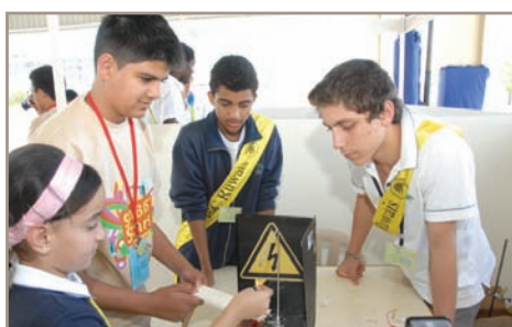
Students from ISC-Ruwais

In many categories, the judges, who included a Head of Department, a Director, a Deputy Director, and a number of AQC's and teachers from ISC-Sharjah and ISC-Abu Dhabi, found it hard to eliminate and then select the winners since all students displayed great talent. "On a personal note, the weekend provided me with the opportunity to get to know the students of Abu Dhabi ChouEIFat better and enabled me to get to know them as individuals outside the classroom," commented one of the judges.