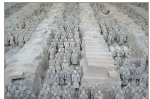
Terracotta Army Project

For more information, visit www.iscegypt-sabis.net .