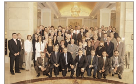
13 th Annual Directors' Meeting