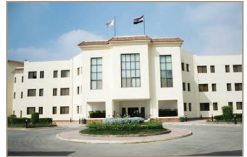
International School of Choueifat – City of 6 October Campus

The school is built on a 60,000 square meter site in the city of Dreamland near the Pyramids of Giza. The campus houses an administration building, two classroom buildings, junior and senior swimming pools, a sports hall, a football pitch, an athletic track, two tennis courts, three well-equipped science labs, a computer lab, an ITL exam hall, and specialty rooms for music and art. Additionally, the school recently received a license to start the second construction phase. Once this phase has been completed, the campus will feature a larger cafeteria and additional 20 classrooms to accommodate the growing number of students.