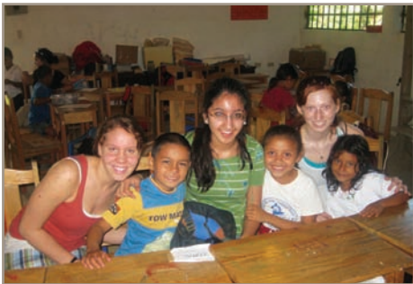
ISM Students with Orphan Children

During the first few days of the trip, the group visited three recipients of funding from the organization "Helping Honduras Kids" in La Ceiba, Honduras. The first stop was the Jungle School, where ISM students played games with the 50+ children aged 5-15 and donated tennis shoes that