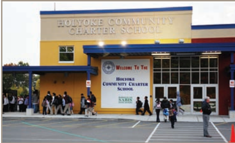
Holyoke Community Charter School