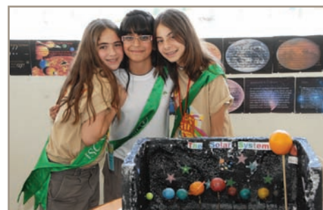
Students Displaying their Project

SABIS® STARS generated an overwhelming response and was able to contribute to SABIS® SLO™'s mission to raise academic standards and encourage development of individual talents. In the current academic year, the event, which is expected to become a fixture on the SABIS® calendar, will involve an increasing number of students, who are eager to demonstrate their abilities and meet students from throughout the network.