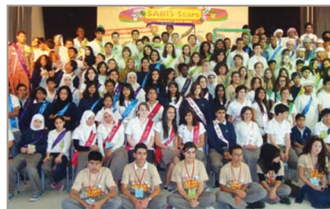
SABIS® Stars Participants

Over 160 students representing ten ISC schools participated in the competition: Abu Dhabi, Al-Ain, Doha, Dubai, Khalifa City, Manama, Military High School, Ras Al-Khaimah, Ruwais, and Sharjah. The competition spanned nine different categories: art, poster design, creative writing, photography, debate, spelling bee, speech, advertising and a science fair. Participating students worked enthusiastically prior to and during the competition to master their chosen assignment.