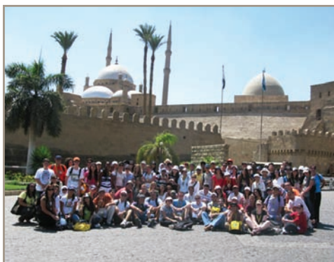
Visit to Saladin Citadel

The sessions were complemented with motivational exercises that focused on team building. They included taking part in a challenging scavenger hunt on the school's campus, coming up with lyrics for songs related to the SLO™, and working on an advertisement about recruiting students, among others.