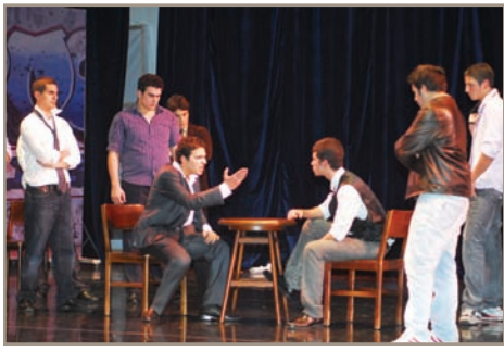
Students Showcasing their Talents

Forty-eight (48) students from various grade levels took part in the play and were aided by 15 students who assisted them backstage in stage setting, costumes, make-up, lighting and sound. Prior to the play, students spent hours rehearsing for the play under the umbrella of the SABIS Student Life Organization®. Their efforts paid off as they showcased a high level of professionalism on stage, not to mention creativity and talent.