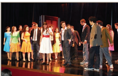
Students Performing on Stage

Once again, ISC-Choueifat students captivated the audience with their interpretation of West Side Story , a play based on Shakespeare's Romeo and Juliet . However, this year, the students decided to donate the proceeds of the play, which was staged at Ivoire Theater – Beirut, to the Children's Cancer Center.