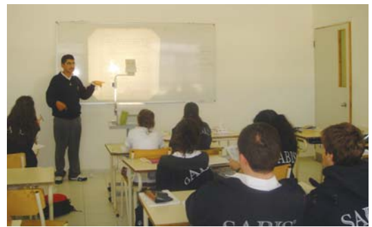
SABIS® Shadow Teacher

Students' involvement in their own education is essential in the SABIS® Educational System and is achieved through the SABIS® Shadow Teaching Program, among other ways. SABIS® Shadow Teachers are trained to become effective classroom leaders, to teach their fellow students, and to develop presentation skills.