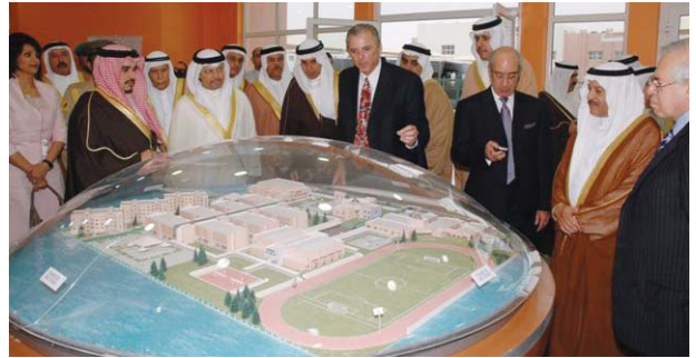
His Highness and officials looking over the school layout

April 11, 2007 also marked an important day for ISC-Manama when the school was honored to receive his Highness Sheikh Salman Bin Isa Al Khalifa along with his entourage of ministers and government officials on a formal visit. His Highness was escorted on a tour of the school campus by the school's Acting Director and school officials.