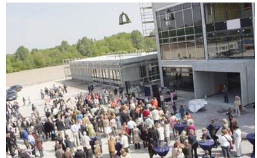
ISR community in celebration

April 20, 2007 saw the celebration of the completed building shell of Internationale Schule am Rhein in Neuss at the Konrad-Adenauer-Ring. In this respect, ISR school community, city and government officials, and representatives from industry and commerce gathered at the construction site to join in the topping out ceremony.