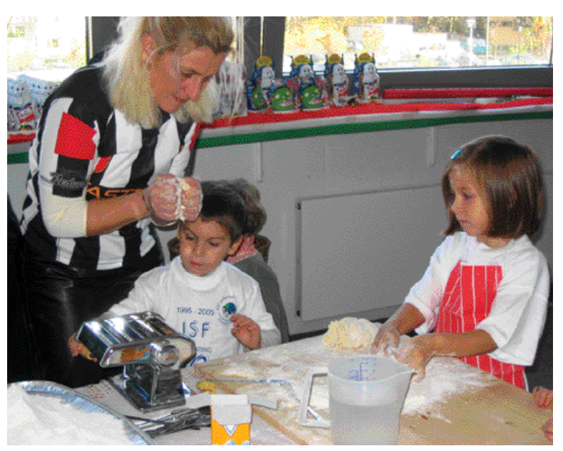
ISF students get a lesson in pasta-making in the Italian focus country room

High turn out of families in the ISF community, the Parent Network , as well as countless teacher and student volunteers helped make the 2004 International Day a memorable event.