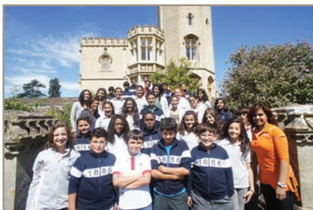
SABIS® Educational Summer Camp Participants on Campus

SABIS® strives to provide students with meaningful academic and extracurricular programs throughout the school year, programs which ensure that students acquire the knowledge, skills, and experiences needed to help them face challenges in college and beyond. In the summer months, SABIS® maintains its commitment to provide students with valuable programs that can enhance student experiences. In fact, during this past summer, hundreds of SABIS® and non-SABIS® students participated in enriching summer camp programs at various SABIS® schools across the worldwide network.