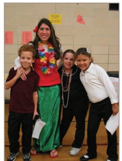
IAF Students and Staff Member Engaged in an SLO ® Activity

Like other SABIS ® member schools, the SABIS Student Life Organization ® (SLO ® ) plays a large role in SICS and IAF's day-to-day affairs. As such, students are encouraged to be empowered by the student-led society and play an active role in their education. Through SLO ® , students have the unique opportunity to manage departments by becoming prefects,