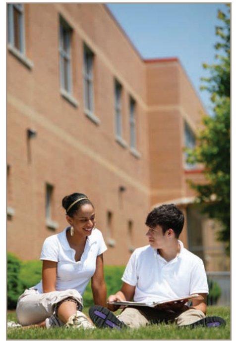
SICS Students Study Outside on School Grounds

Students enrolled at SICS and IAF follow a curriculum that has been carefully tailored to accommodate both their future plans for university and the rapidly changing, global society. This includes studying mathematics, English, and world languages—SABIS® core subjects—among other subjects. Furthermore, students are prepared to sit for and excel on external exams, such as Advanced Placement® exams, facilitating their admission to top universities.