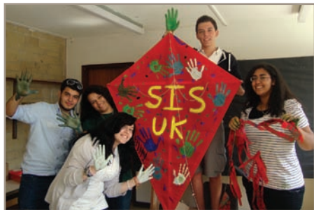
SABIS® Educational Summer Camp Participants Involved in the Camp's Kite Club

In Bath, U.K., the SABIS® Educational Summer Camp was again offered to students. Held at the bucolic SABIS® International School-U.K. campus, which includes 148 acres of pristine British countryside, the program attracted students from near and far. One hundred and seventy-one (171) students coming from SABIS® and non-SABIS® schools took part in either the three-week or five-week camp options.