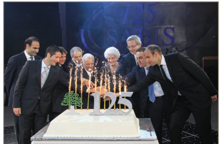
SABIS® Board Members Participate in a Cake-Cutting Ceremony

Over the past year, SABIS® students, staff, and supporters have been engaged in 125 th anniversary celebrations around the world. These celebrations have honored the organization's ongoing contribution to the field of education for more than a century. With the new academic year already here and SABIS®'s 125 th year winding down, the organization took the opportunity to host a