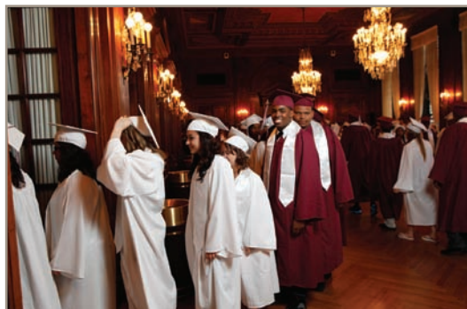
SICS's Class of 2011 at their Commencement Ceremony

SABIS® students and graduates are continuously being recognized for their academic aptitude and often are recipients of enviable college scholarships for their achievements. The recent graduates from the SABIS® International Charter School (SICS) in Springfield, Massachusetts, are no exception. In addition to becoming the 11 th consecutive class of graduates with a 100% acceptance rate to college and university, SICS's class of 2011 was awarded a total of $9 million in scholarships.