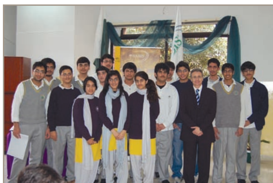
ISC-Lahore Students Honored at LUMS Psi-Fi Olympiad Appreciation Ceremony

Through the comprehensive SABIS® Educational System including a world-class curriculum, SABIS® students acquire a broad foundation of knowledge on which they can build a successful future. Demonstrating the solidity of their academic skills, students at the International School of Chouefat-Lahore in Pakistan had a successful 2010-11 academic year that included several notable achievements.