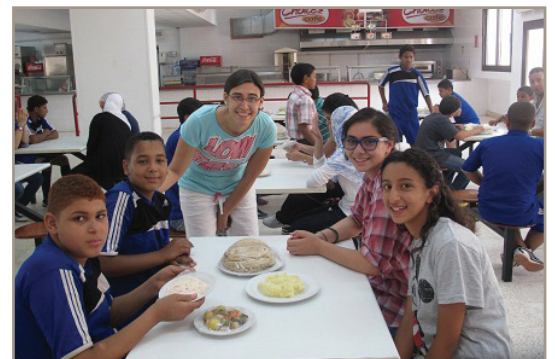
ISC-6 October Students and Summer Camp Participants Enjoy a Meal Together