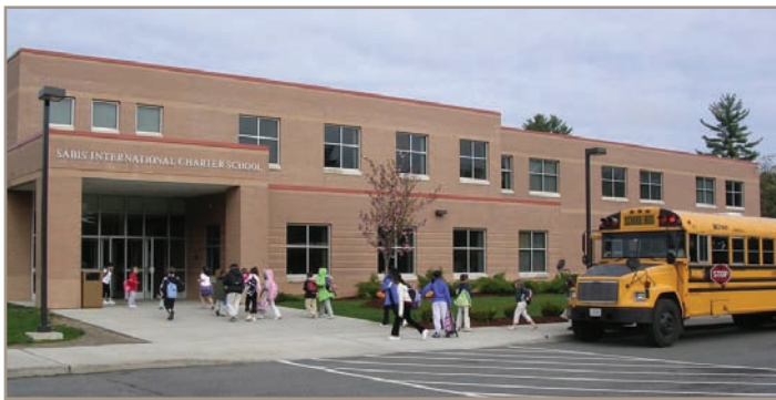
SABIS® International Charter School