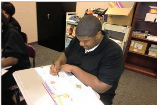
IAF 10 th Grader Works on a Class Assignment

The schools' success in providing students with a high-quality education and strong academic foundation has also been noted by popular American media. In fact, IAF has been among U.S. News & World Report's "America's Best High Schools" for three years in a row, while SICS has been recognized by both Newsweek and U.S. News & World Report as one of "America's Best High Schools" on more than one occasion in recent years.