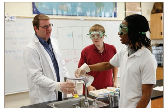
SICS Teacher and Students Take Part in a Science Experiment