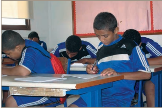
Summer Camp Participants Engaged in a Lesson

Students and staff at the International School of Choueifat-City of 6 October (ISC-6 October) in Cairo, Egypt, regularly give back to their community through the school's active Student Life Organization®. Demonstrating their commitment to making a difference, students and staff members continued their projects even into the summer, despite the school being on break for the season. In fact, nearly 30 ISC-6 October students, alumni, and staff members volunteered their time this summer and organized a summer camp program for homeless children.