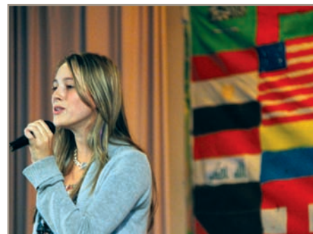
Student Performs at the Camp's Talent Show

Though the SABIS® Educational Summer Camp is over and the next camp is not for nearly a year, students are already looking forward to the upcoming program. "I am counting down until next year's summer camp!" exclaimed one former camper. Eager students look forward to new summer camps filled with meaningful academic and extracurricular activities, plus the opportunity to make new friends.