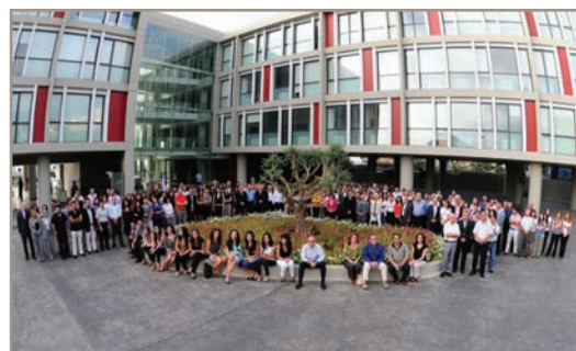
SABIS® Team Members at the Inauguration of the Ralph A. Bistany Development Center

After nearly two years of careful planning and building, the construction of SABIS®'s new corporate headquarters in Adma, Lebanon, was recently completed. The state-of-the-art, multi-story structure is now in operation and accommodating all SABIS® Educational Services personnel.