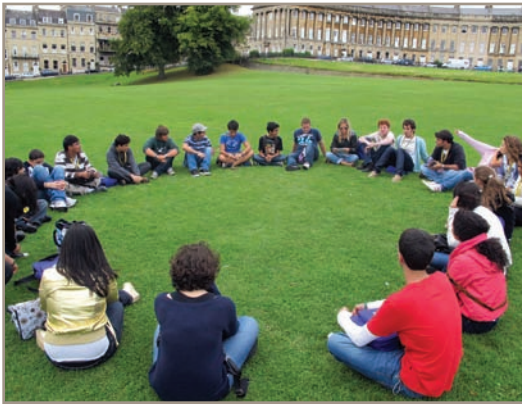
SLTC Participants Engaged in an Outdoor Group Activity

who participated in this special opportunity: