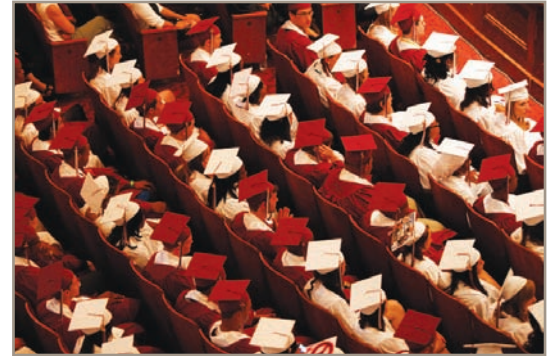
SICS's Class of 2011 at their Commencement Ceremony

Beyond success on state exams, students at SICS and IAF have demonstrated their academic competence in other ways. For instance, SICS's 126-strong Class of 2011 not only all gained entry to college or university, but they were awarded a total of $9 million in scholarships. Additionally, 43 of the 63 students, or 68%, who sat for AP ® exams in May 2011 at SICS received a score of three or higher on at least one exam, plus three students were recognized as AP ® Scholars. IAF has seen similar academic success among its students, with its 2011 graduating class having earned more than $425,000 in scholarships, plus earning the Michigan Charter Schools of Excellence award, and the "Beating the Odds" award by the Michigan Association of Public School Academies.