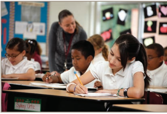
SICS Students Engaged in a Class Lesson

to students in grades 3-11 at the schools. Combined, these two schools closed the African-American—Caucasian gap on 14 of the 35 exams or 40%. Also, together, these two schools had a narrower African-American—Caucasian gap in 19 of the 35 exams or 54%. Therefore, on 94% of the tests, SICS and IAF either closed the gap completely or were more successful than their two host states in closing the gap. Moreover, the state tests found that minority and low-income students attending SICS and IAF were outperforming their states' Caucasian and economically-advantaged peers by the time they reach the 10 th grade.