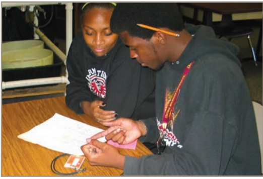
IAF Students Coordinate an SLO® Activity

or they can participate in and contribute to clubs, events, and extracurricular activities. By fostering the exploration of a wide range of interests and promoting the development of students' individual talents, SICS and IAF ensures that students acquire a broad range of skills and experiences so they can become effective and valuable team players, and strong candidates at top universities around the world.