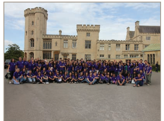
SLTC Participants on SIS-U.K. Grounds

"The most amazing 10 days of my life...It has changed my life, broadened my perspective, and bolstered my confidence. I have made friends and shared memories that will last a lifetime." –SLTC Student Participant