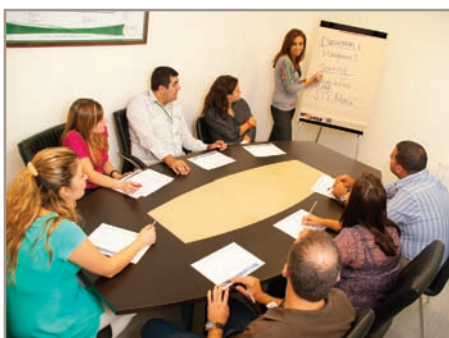
SIS-Adma Teachers Engaged in Classroom Management Training