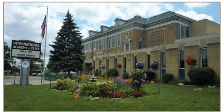
International Academy of Flint

Two SABIS® charter schools in the U.S. are regularly in the spotlight for their efforts in closing the achievement gap and raising the bar academically in the communities they serve.