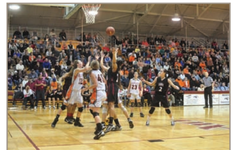
Girls SICS Basketball Team Compete at a Game

Through the schools' SLO®, students are provided the resources and outlet to take up new interests and develop their individual talents. One of the many activities available to students is sports. SICS, whose sports teams are known as the Bulldogs, offers 14 varsity sports—including volleyball, softball, tennis, and basketball, among others—to its students in grades 9 to 12. Showcasing the school's strong commitment to SLO® and its sports offerings, SICS's athletic program was recently awarded a Republican Trophy by The Republican , a Springfield-based newspaper, for the school's girls and boys sports program and placed 1 st in the 'small schools' division among three counties.