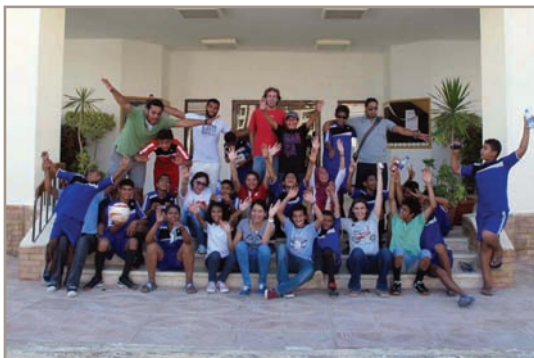
Summer Camp Participants with ISC-6 October Students and Staff Volunteers